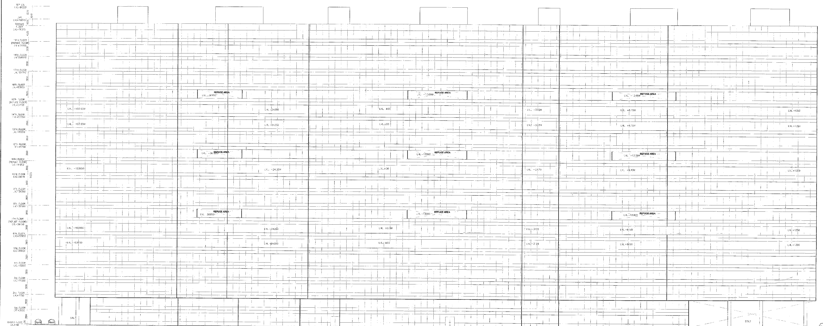
ELEVATION - C (BLOCK-F)

OWNER: DLF Cyber City Developers Ltd 10th Floor DLF Gateway Tower, DLF Cyber City, Gurugram, Haryana PIN: 221002