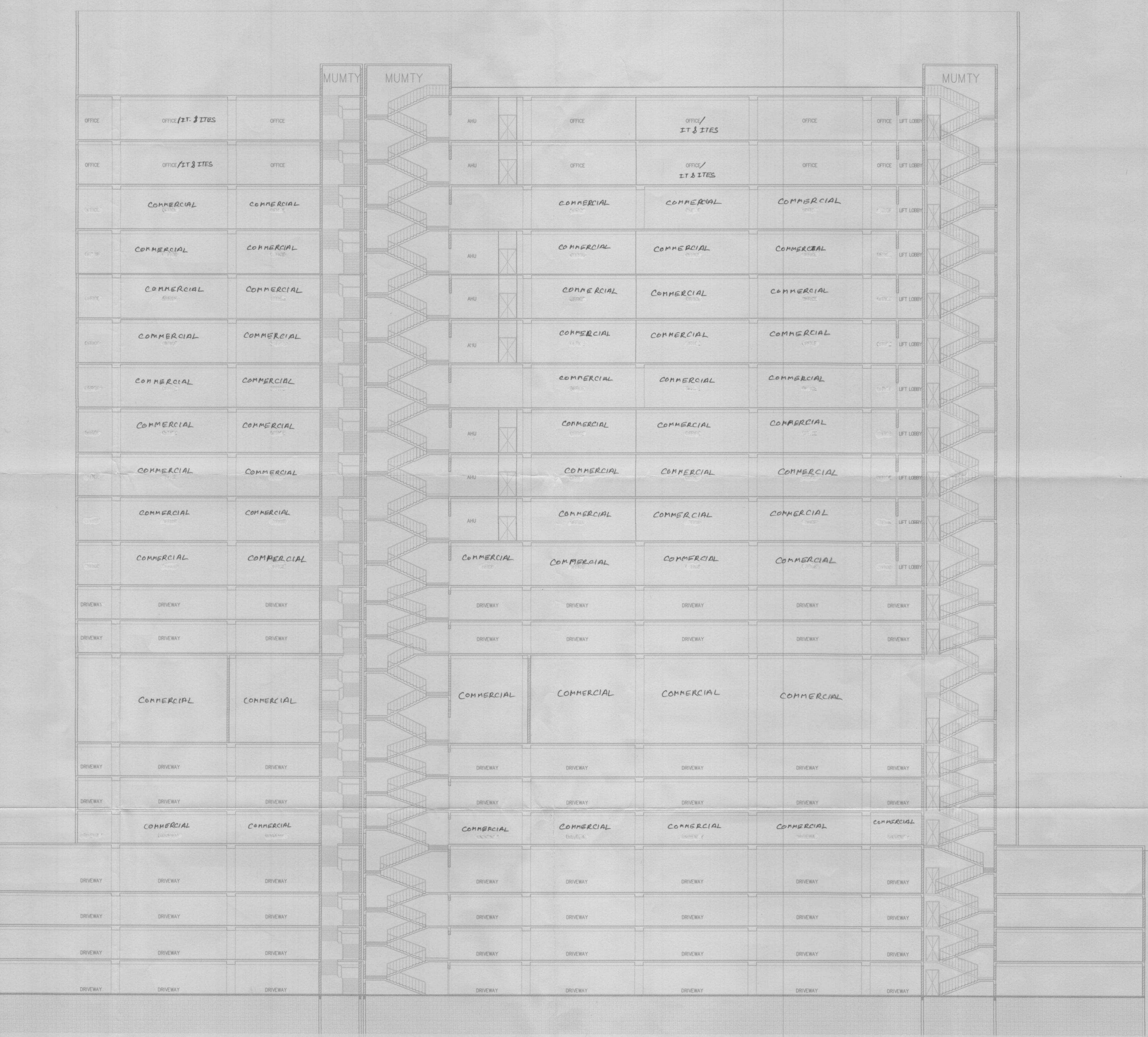
SECTION Y-Y' BUILDING-E

Handwritten signatures and initials of project team members.