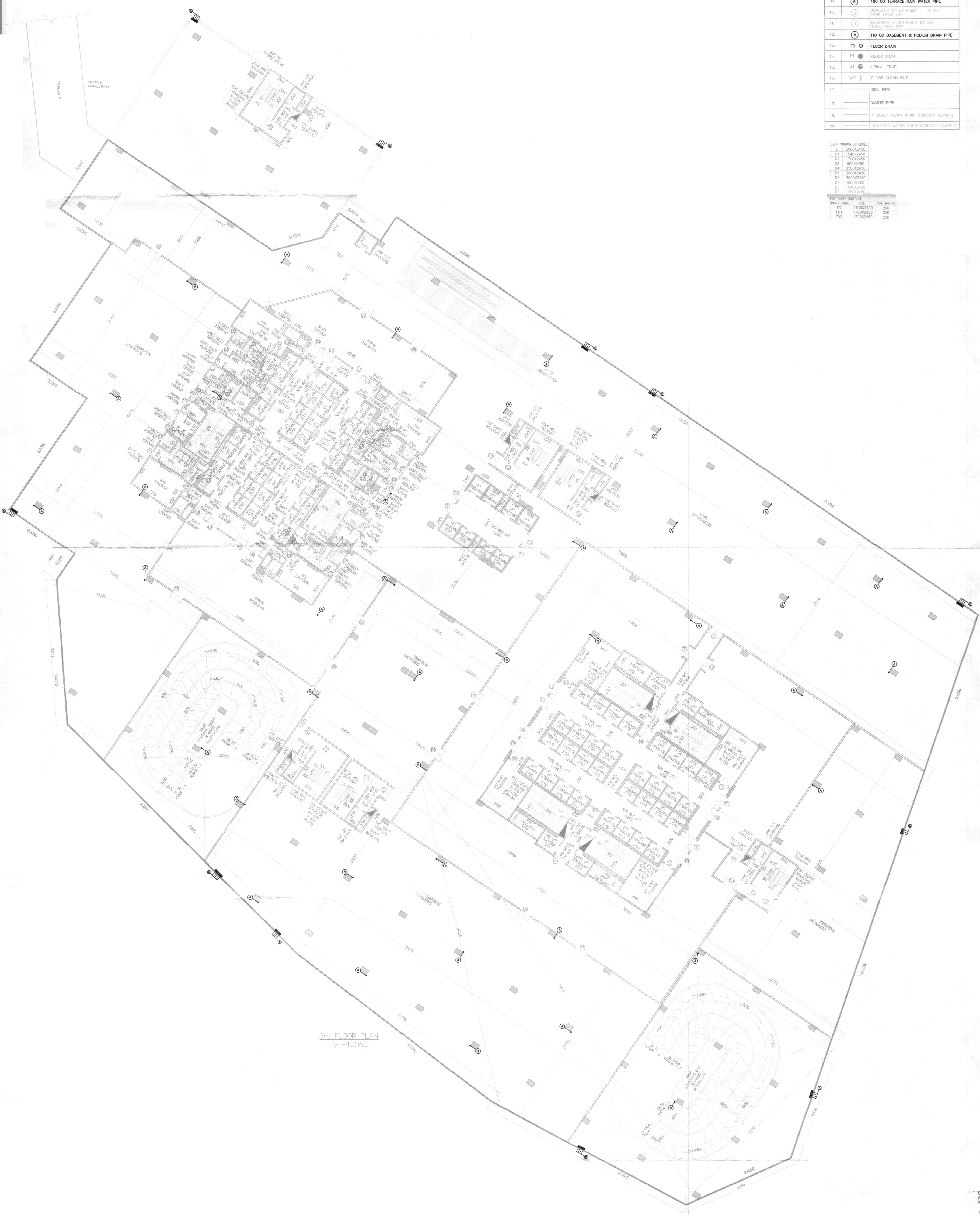
3rd FLOOR PLAN LV.+10050

A.D.F. No. 101 DFS PKL Member B.P.C. (Signature) R.M. AVTAR BASSI A.D.