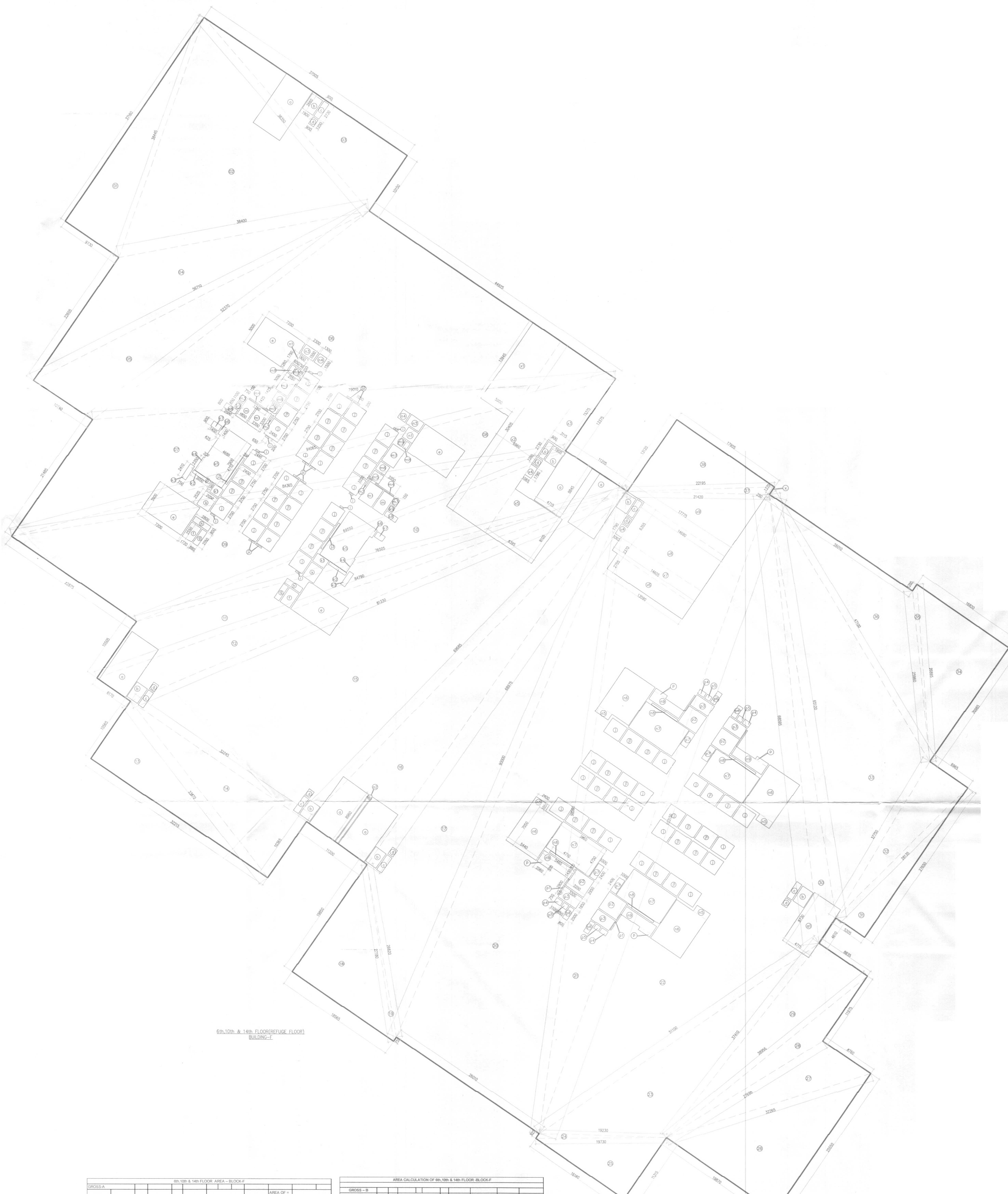
6th, 10th & 14th FLOOR (REFUGEE FLOOR) BUILDING - F