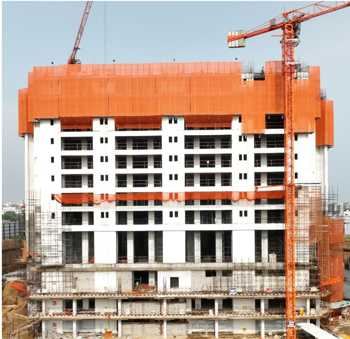
Tower D – 9F Slab WIP