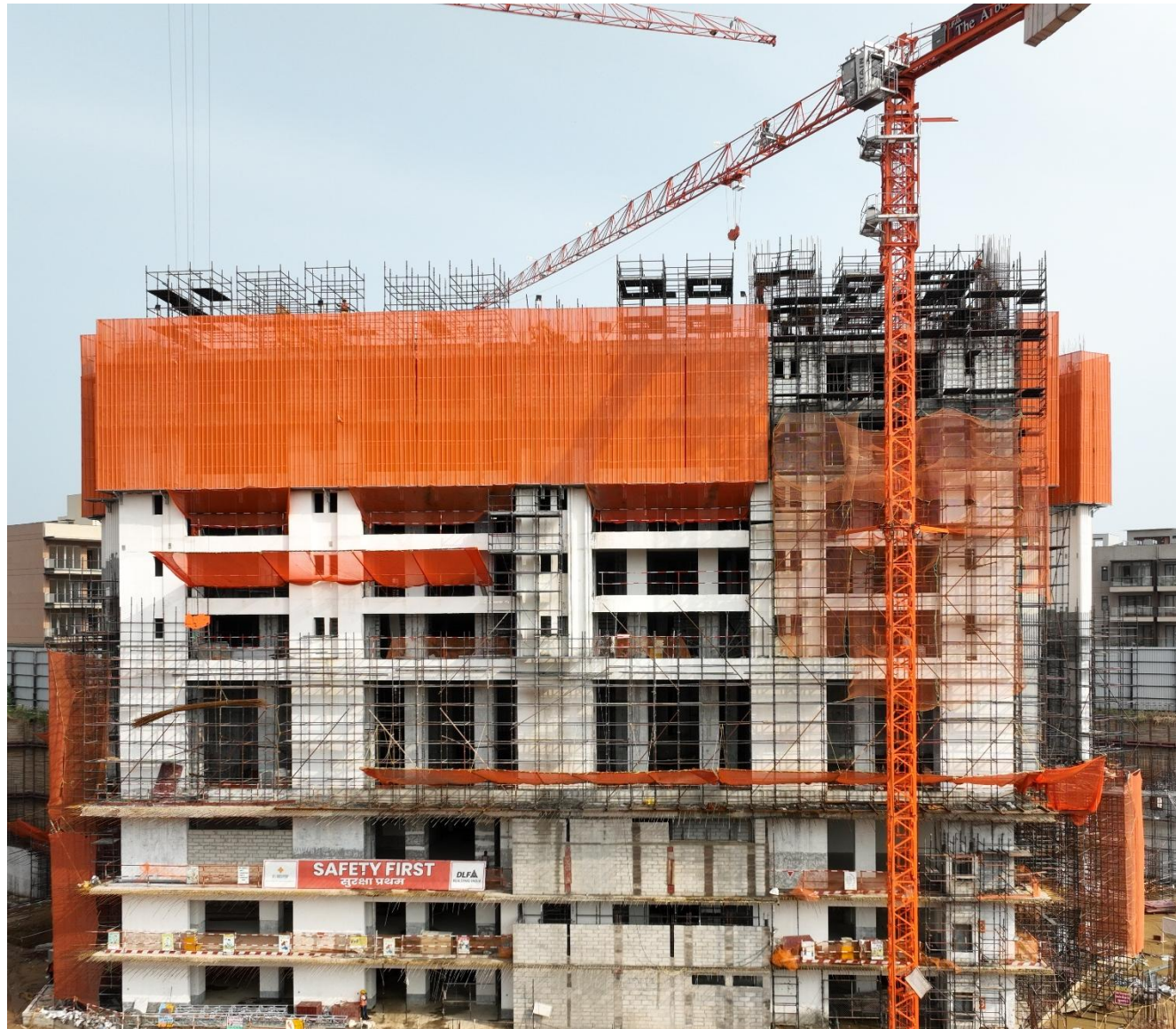
Tower E – 6F Slab WIP