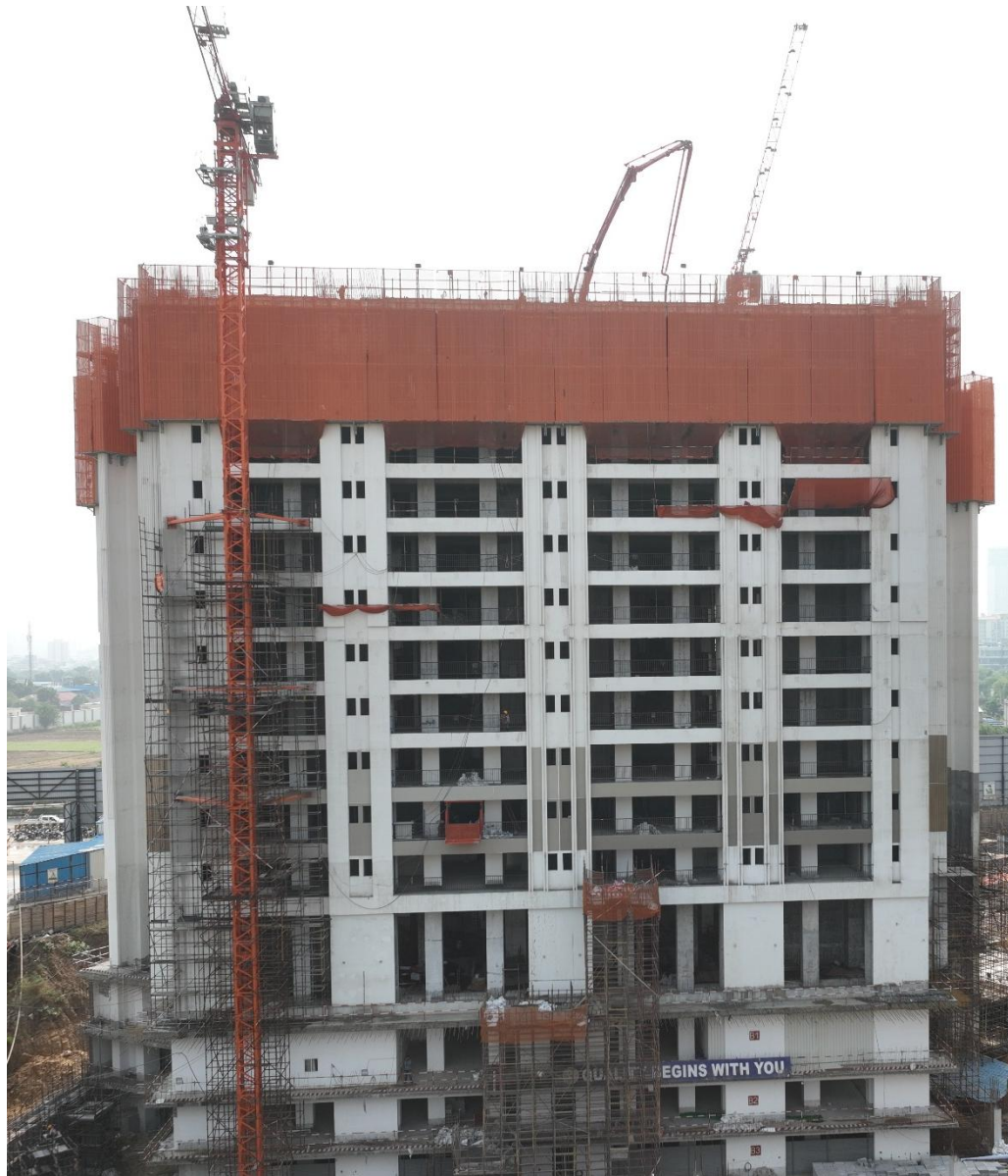
Tower A – 12F Slab WIP