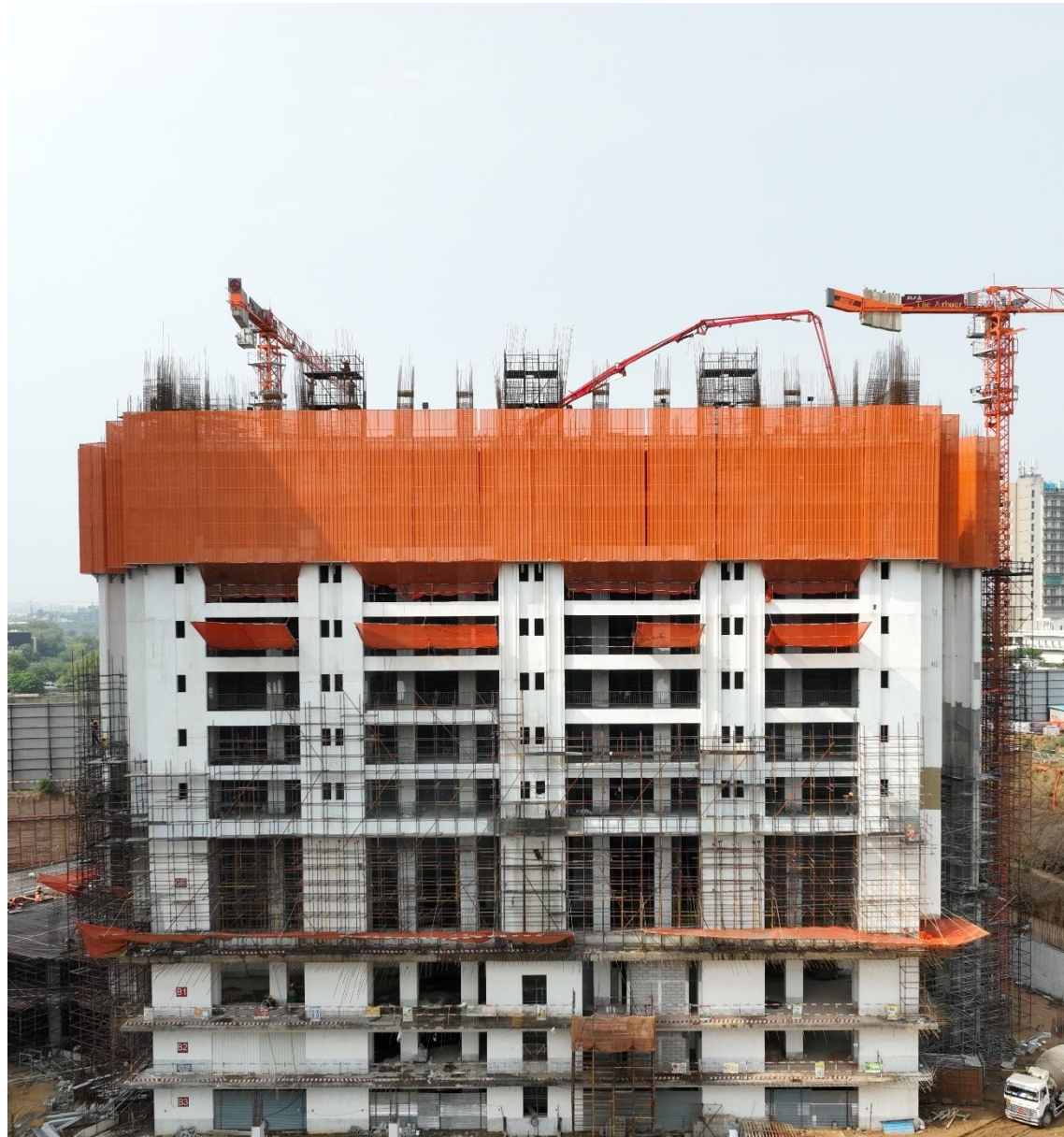
Tower C – 9F Slab WIP