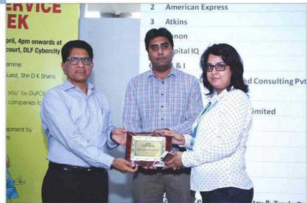
Nokia Siemens Networks