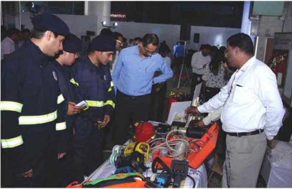
Fire Equipments Exhibition