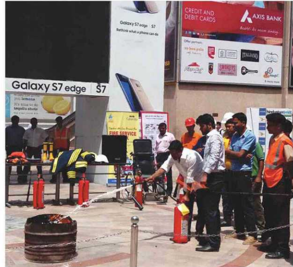
Mock Fire Drill

He applauded DLF for their constant commitment towards ensuring fire safety for its clients and said, "This awareness week is to prevent the loss of life and property and whenever you can help someone please come forward, as life and property saved directly contributes in nation's development."