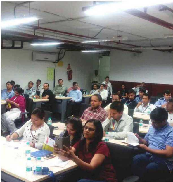
Mass Awareness Session

The event was accepted as a mass-educating platform where the need for propagating a fire safety culture was emphasized and saw active participation by all corporates who also appreciated the importance of learning fire prevention and fighting procedures.