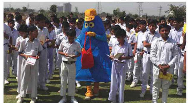
SAFEEO with School Children

Equipped to face every infrastructural challenge in terms of fire protection, DLF has India's first private fire station with a 90 meters high hydraulic skylift that can reach upto 30 floors in case of any contingency.