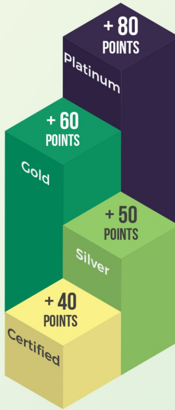
LEED CERTIFICATION RATING SYSTEM

LEED is the top third-party verification system for sustainable structures around the world. It tests a building on the following parameters with points awarded for each.