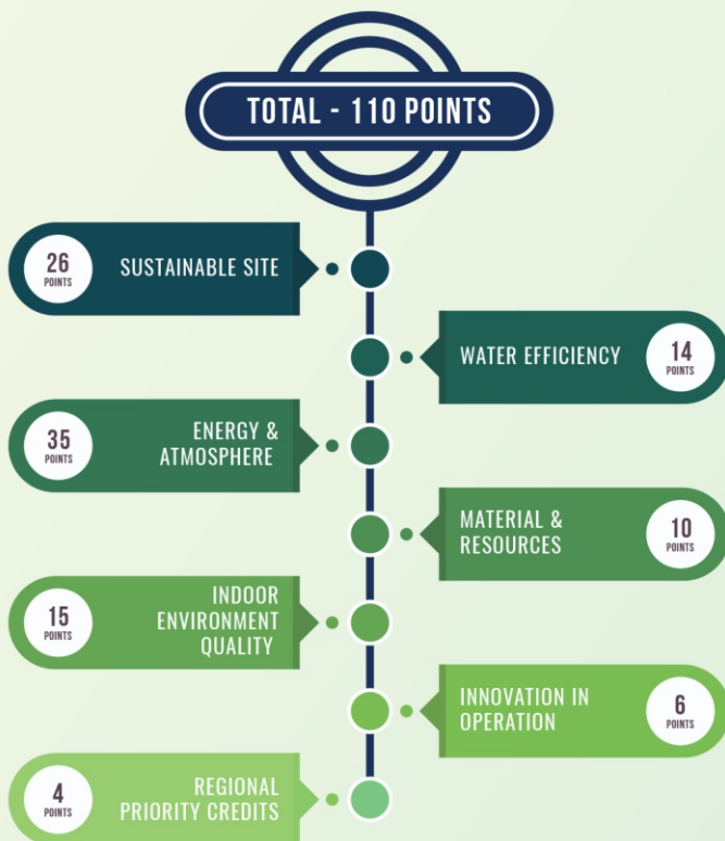
LEED CERTIFICATION CREDITS

There are 4 levels of rating, and a total of 80 points or more, makes a building eligible for the highest rating i.e. LEED Platinum.