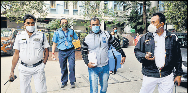
Bharat Biotech's Covaxin being carried to a hospital in Kolkata on Wednesday.

These states and Union Territories that have not reported any deaths are Andaman and Nicobar Islands, Daman and Diu & Dadra and Nagar Haveli, Arunachal Pradesh, Tripura,